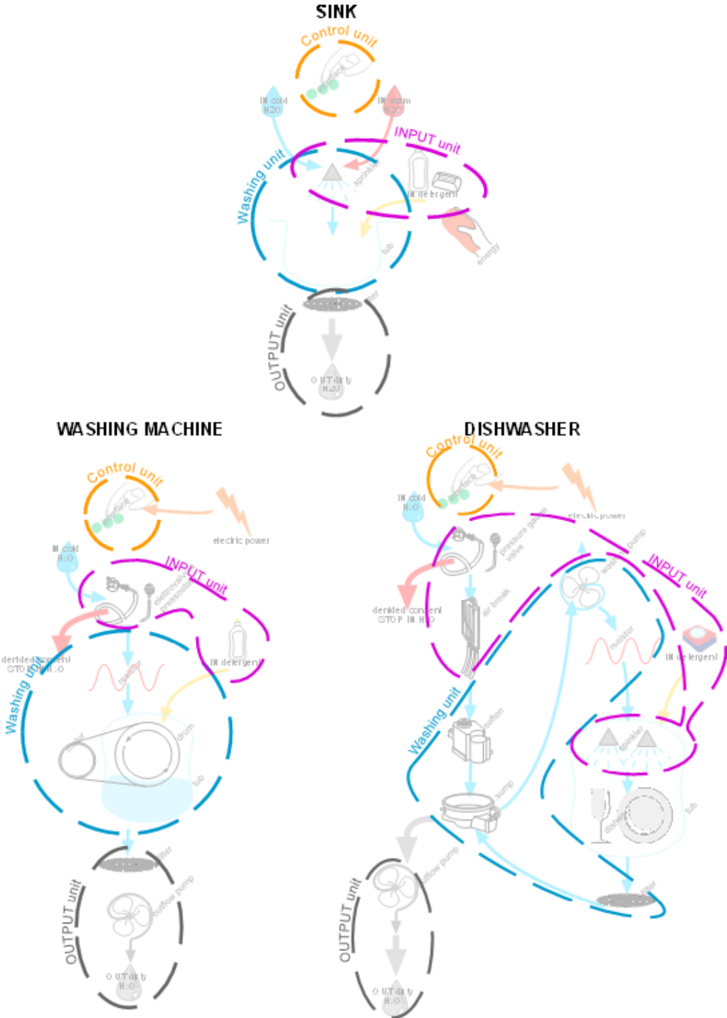
Fig 2: Comparing the three systems can be noticed the common elements, underlying the redundancy of the components of a washing systems.

An international conference on the role and potential of design research in the transition towards sustainability