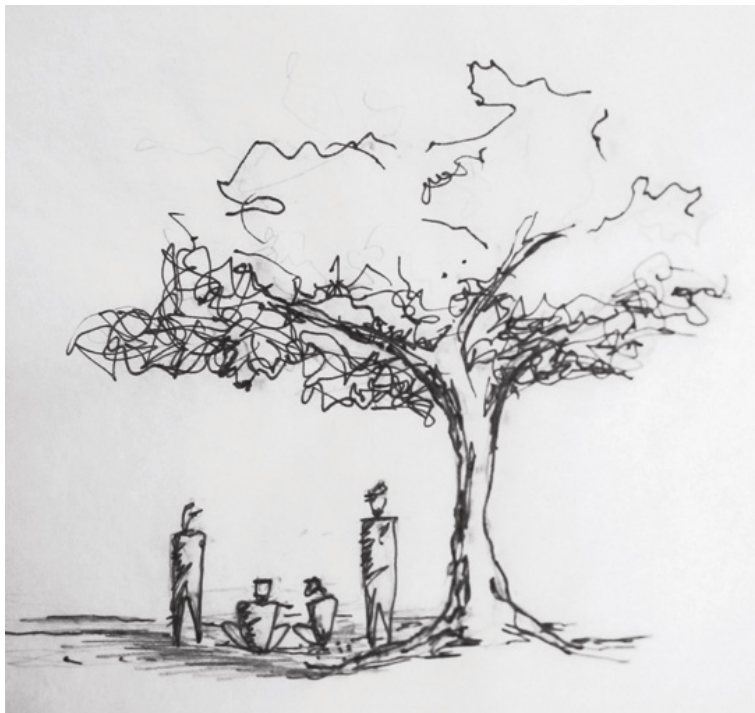
Fig. 1: International Workshop, Tsinghua University Beijing.

The Mariendalsvej senior co-housing was built in 1993 with the collaborations of an academic team. The architects paid a lot of attention to the ecological aspect of the project and they tried to create a suitable, safe and pleasant environment for elderly people.